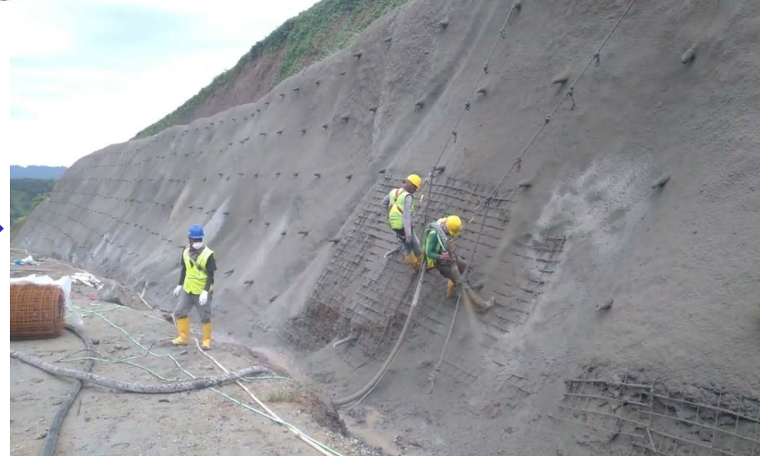
Example of shotcrete being used for slope stabilization →