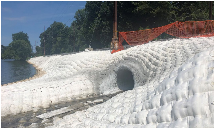
← Example of fabric formed articulating concrete block mattress installation